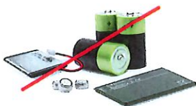
NO Batteries – check local drop-off programs for proper disposal NO baterías - Verifique los programas locales de entrega para su correcta eliminación