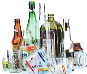
Glass Bottles & Containers Botellas y envases de vidrio

✗ DO NOT INCLUDE IN YOUR MIXED RECYCLING CONTAINER / NO INCLUIR EN SU CONTENEDOR DE RECICLAJE MIXTO