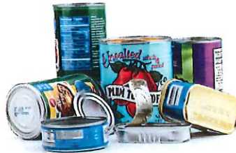
Food & Beverage Cans Latas de alimentos y bebidas