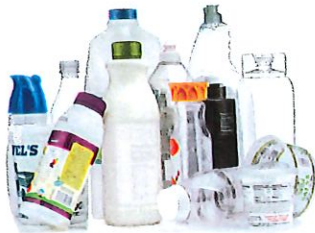
Plastic Bottles & Containers Botellas y envases de plástico