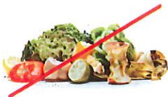
NO Food or Liquids NO comida o líquidos

✗ DO NOT INCLUDE IN YOUR MIXED RECYCLING CONTAINER / NO INCLUIR EN SU CONTENEDOR DE RECICLAJE MIXTO