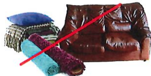
NO Clothing, Furniture & Carpet NO ropa, muebles y alfombras

To learn more, visit: Para más información, visite: wm.com/recycleright