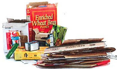
Flattened Cardboard & Paperboard Cartón y cartulina aplastados