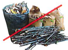
NO Green Waste NO desechos verdes