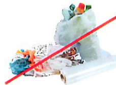
NO Loose Plastic Bags, Bagged Recyclables or Film Empty recyclables directly into your bin. NO bolsas y envolturas de plástico sueltas, o materiales reciclables embolsados Vacíe directamente los materiales reciclables en nuestro carrito