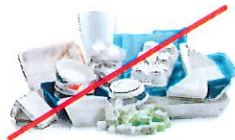
NO Foam Cups & Containers NO vasos y recipientes de poliestireno